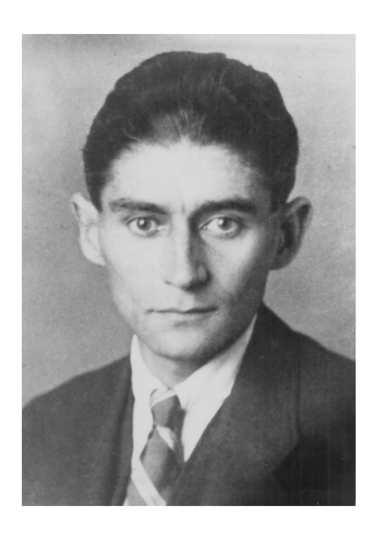
9. Kafka, 1923 or 1924.