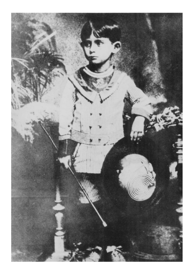
1. Kafka at the age of four.