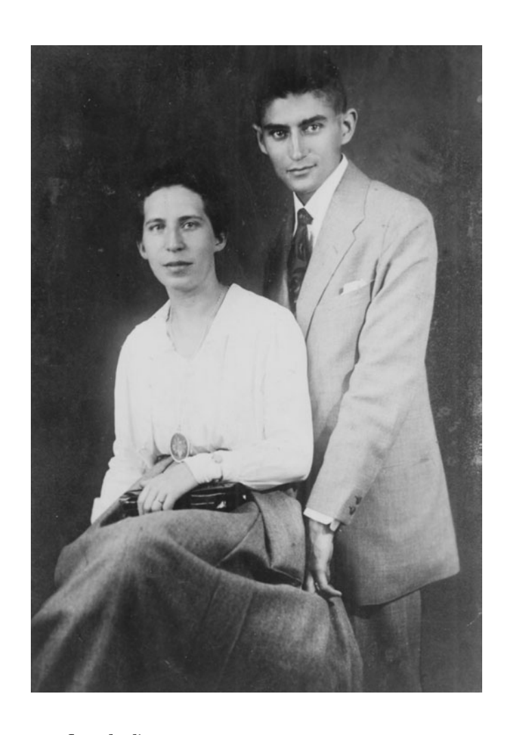
6. Kafka and Felice Bauer, 1917.