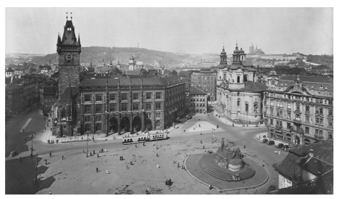
7. The Old Town Square in Prague.